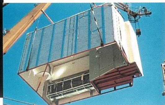
M/V Crystal Symphony, luxury cruise liner for Crystal Cruises, Inc. Built by Kvaerner Masa-Yards Inc. Turku New Shipyard.

Prefabrication produces better quality than construction on board. The result: superior quality cabins.