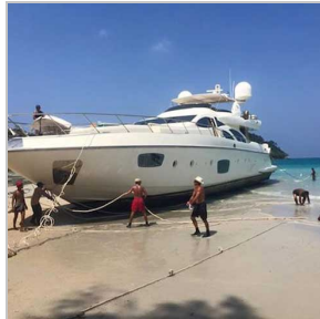
Russian billionaire fugitive beaches 98-foo...