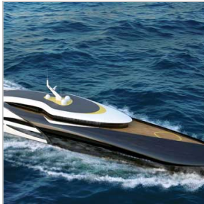
A Submersible Superyacht?