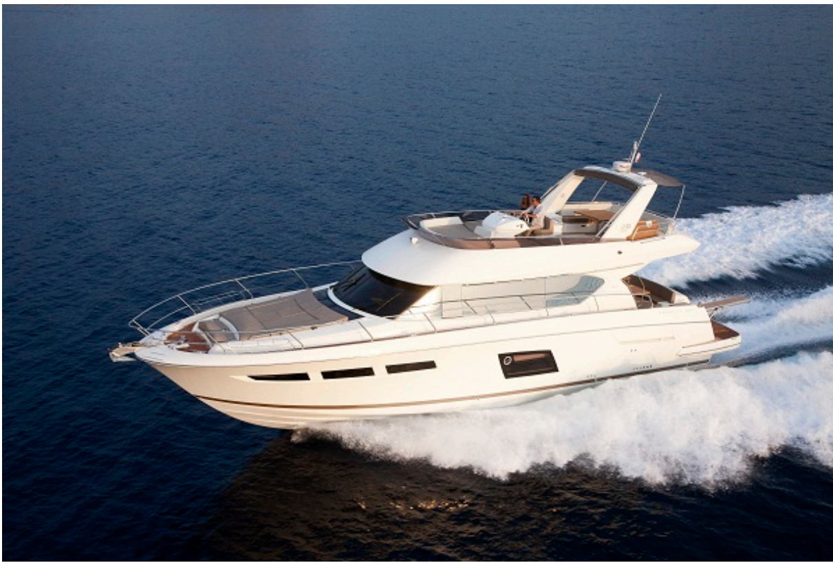
Prestige 620 Fly