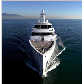
Perini Navi's Amazing GRACE E