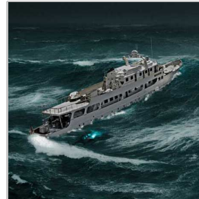
Mayday In The Med